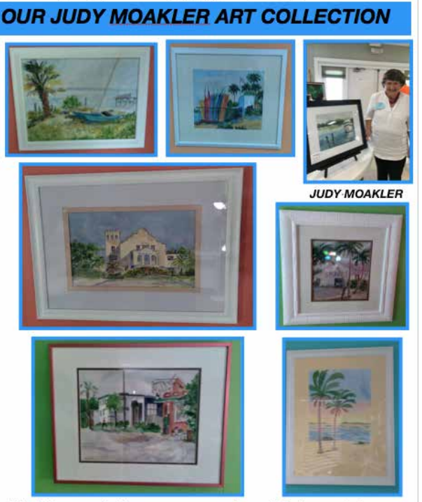
All of these paintings are scenes from this immediate area.